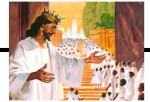
Homegoing at Second Advent Rev 14:14-16