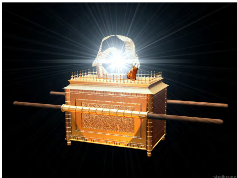
The Ark of the Covenant

Inside the ark were three items---the two tables of stone, the golden pot of manna and Aaron's resurrected rod. Aaron's rod was an almond branch that bore buds and blossoms and fruit. In the golden limbs of the seven-branched candlestick this motif was repeated. Whenever Israel saw that motif they thought of the resurrected rod---the power of God to vindicate His priesthood, to bring life out of a dead stick and to perform the miracles of transforming grace. The living branches of the seven-branched candelabra upheld the light. It is life, which uplifts the light.