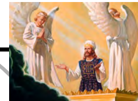
Pre-Advent Judgement Dan 7:9,10; Rev 11:19; 14:7