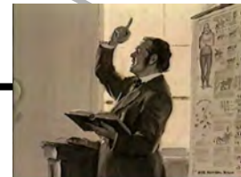
Second Advent Movement Rev 14:6,7