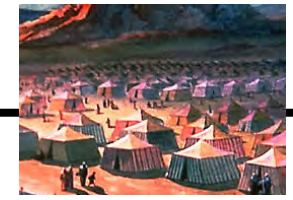
Feast of Tabernacles Tishri 15 Seventh Month Lev 23:33-36