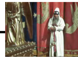
Day of Atonement Tishri 10 Seventh Month Lev 23:27-32