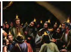
Pentecost Acts 2:1-4; Rev 5:6