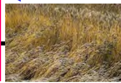
First Fruits Nissan 16 First Month Lev 23:9-14