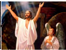
Resurrection 1 Cor 15:20