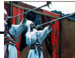
Trumpets Tishri 1 Seventh Month Lev 23:23-26