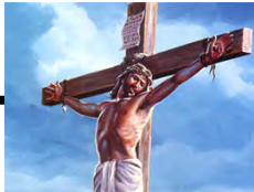
Crucifixion 1 Cor 5:7