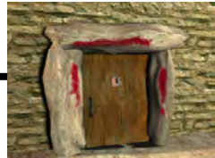
Passover Nissan 14 First Month Lev 23:5; Ex 12