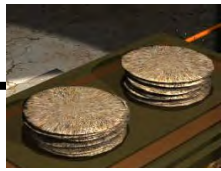
Unleavened Bread Nissan 15-21 First Month Lev 23:6-8