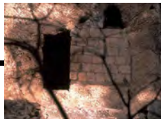
Christ in Tomb John 6:51; John 12:24