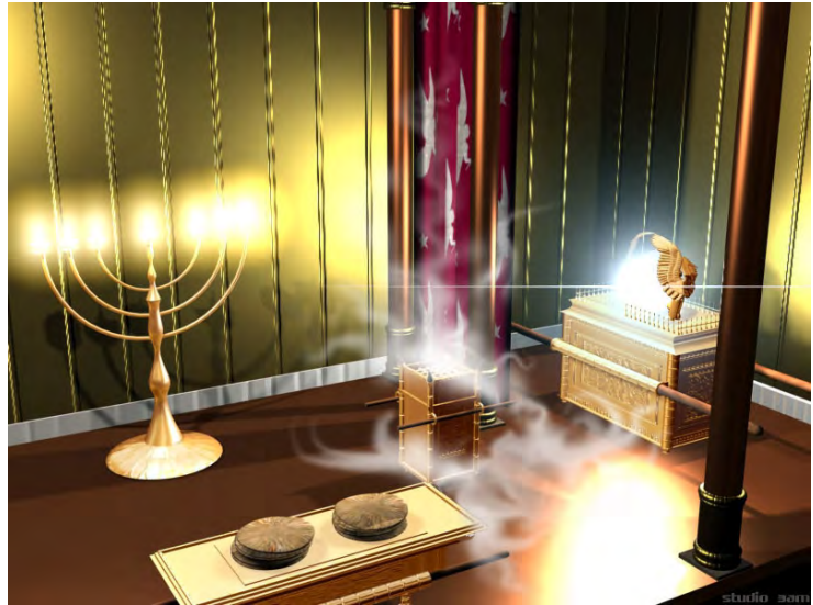
The Holy and Most Holy Place

Now, think a moment on how this bread was prepared. The wheat was put into the soil. It died. It rose again, brought forth some sixty fold, some eighty fold, some a hundred fold. It was then reaped, threshed, and winnowed. The grains were put between the upper and nether millstones and they were ground. The flour was mingled with oil. Salt was added. This represents the character of Jesus Christ. Fire was applied. Only then was it presented to the Lord. Before it could be eaten it must be broken. Finally the priests partook of it. It became bone of their bones and flesh of their flesh. The bread and priests were identified completely. Each Sabbath day this bread was to be new. Thus is the Bread of Life. The Word that we preachers proclaim should be the Bread of Life.