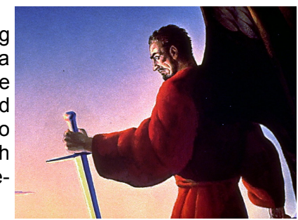
Satan bound by a chain of circumstances, he has nothing to do and can't leave the desolate earth

Notice, however, that his deception is not yet over, for when the thousand years are expired, he is set free for a