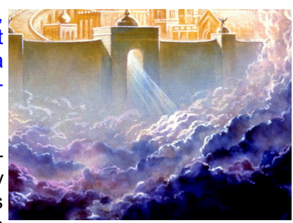
The heavenly city descends to earth

The descent of the city is not described in Revelation 20, but evidently the event has occurred, as the city is mentioned as being on the earth in Revelation Chapter 20 verse 9.