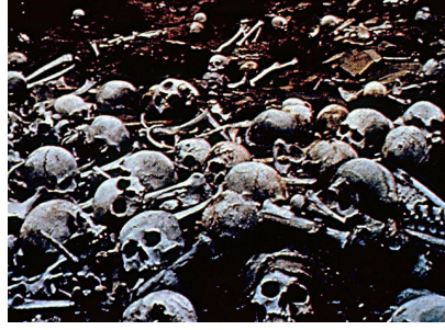
The earth will be totally desolate during the millennium

This is a prophecy originally addressed to literal Israel, but will finally be fulfilled at the Lord's Second Coming. It parallels with the predictions of Revelation Chapter 20.